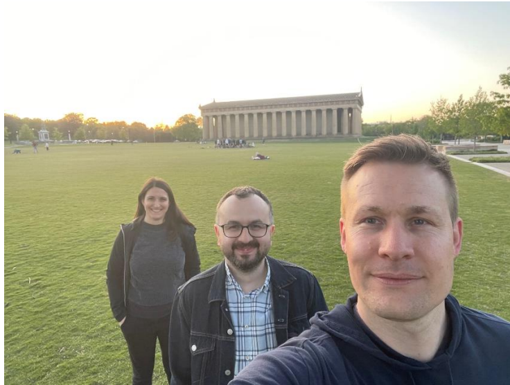
Enjoying a leisurely walk in the Centennial park