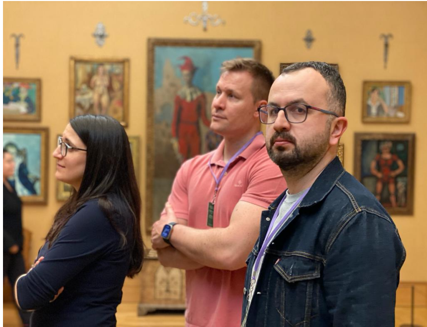
Is art for people or for art's sake?