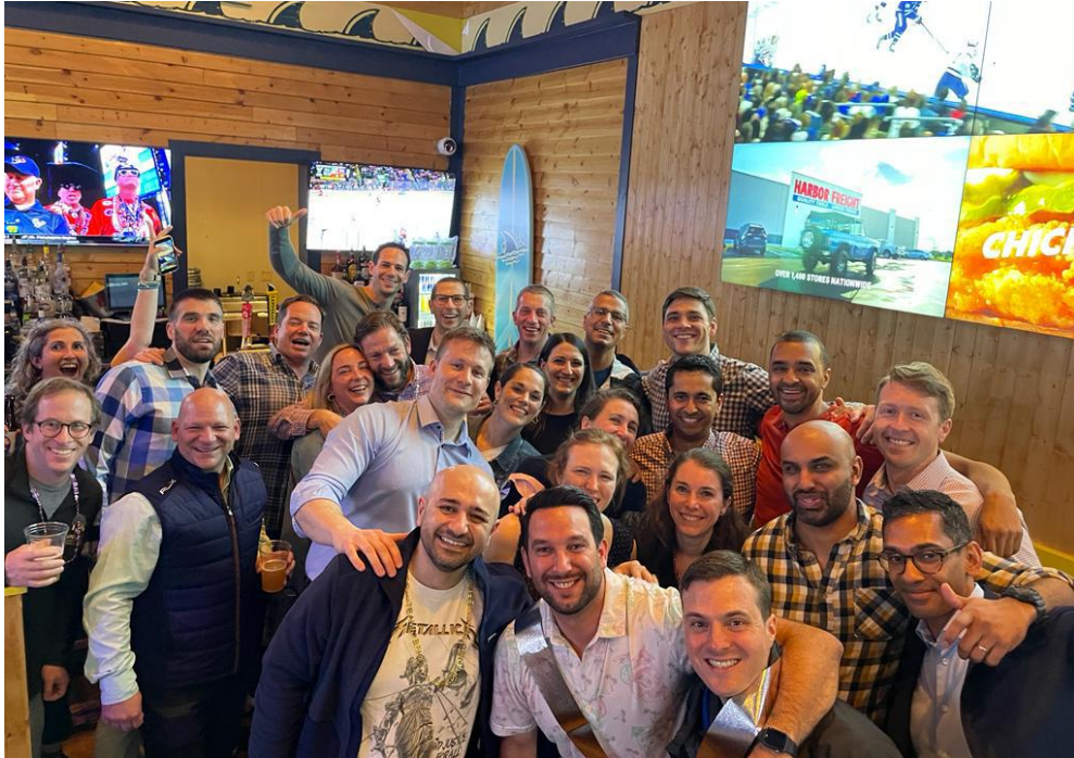
CHOP Alumni night event