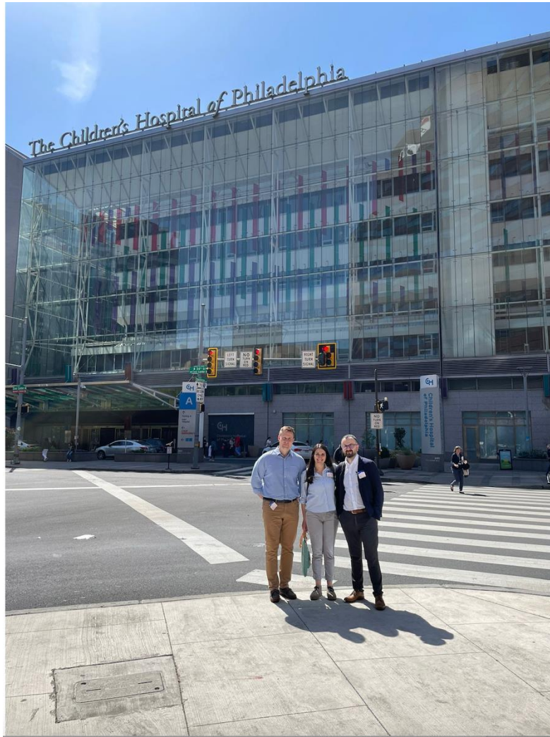
EPOS fellows at CHOP