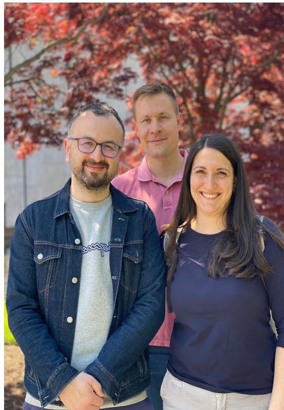
We are in a Philly mood!

Our Friday night activity was to watch a Phillies baseball game with CHOP crew. Hot dog in one hand, a big glass of beer in another, still clueless on the rules of the game at the end but had a blast! That was such an American experience!