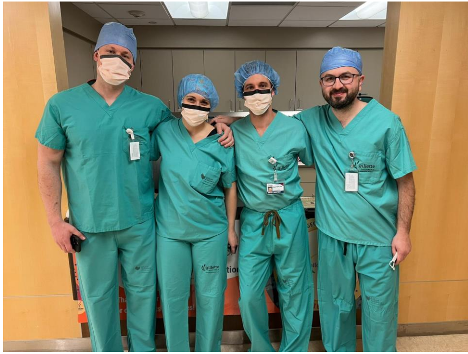
The “Green gang” entering the operating rooms