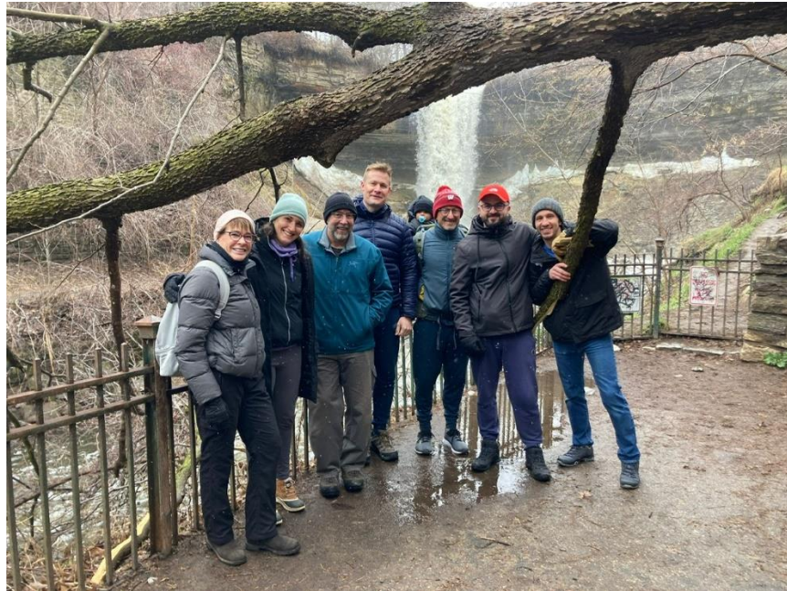
Fun at the Minnehaha falls! All smiles and one pacifier