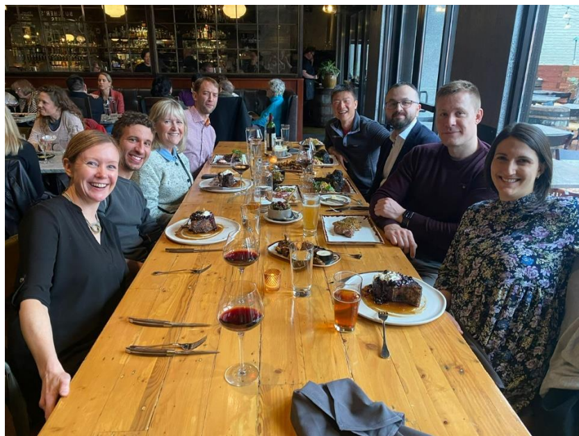
American style BBQ with our hosts – how ‘bout those portions!