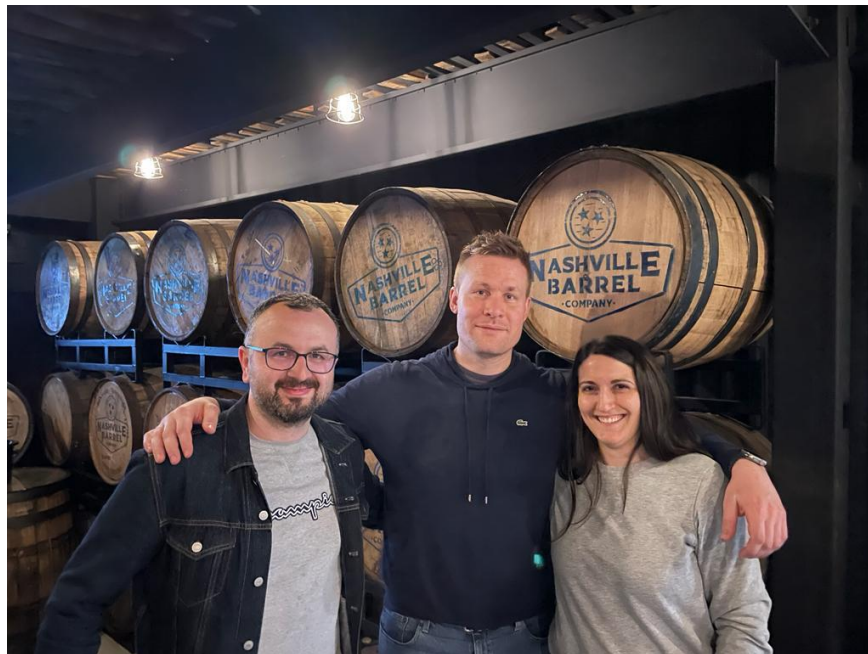
Fellows at Nashville Barrel Company Distillery