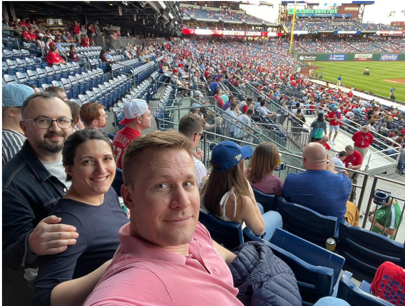
EPOS fellows at the Philadelphia Phillies game!