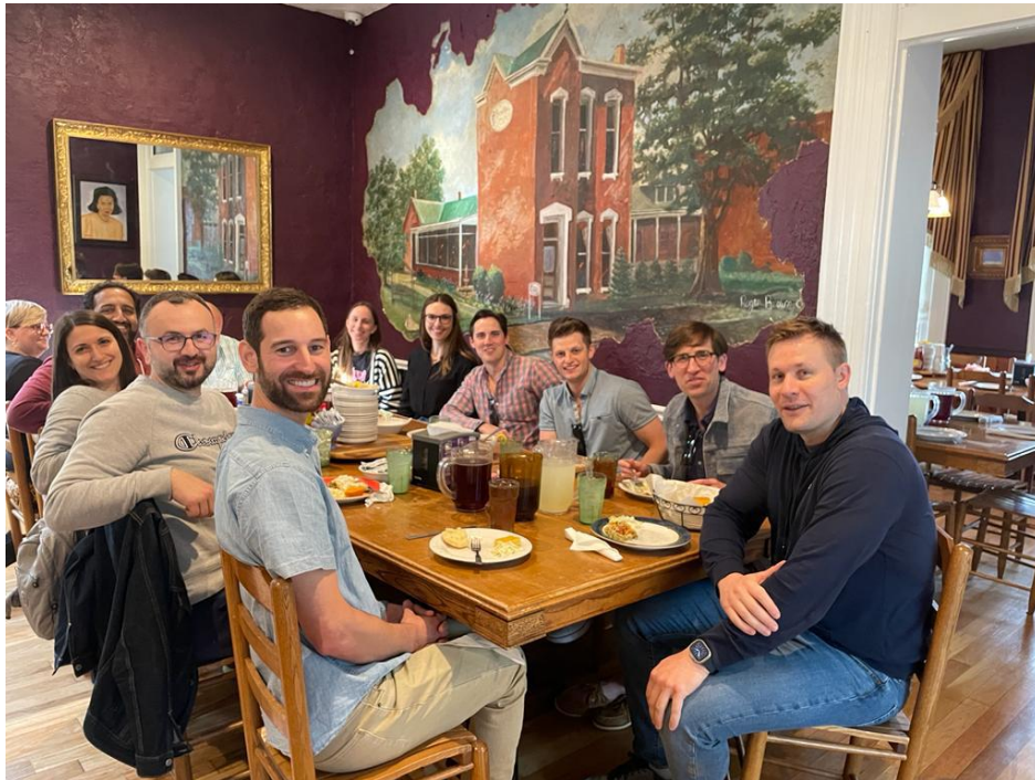
At a local Southern restaurant with the Vanderbilt crew